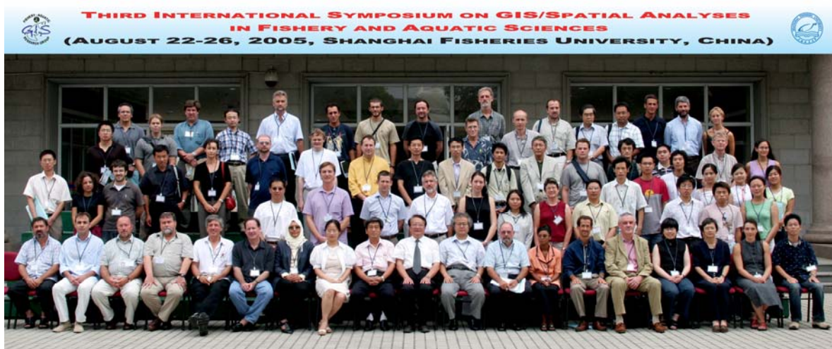
Group photo (Third Symposium at the Shanghai Fisheries University, China in 2005)